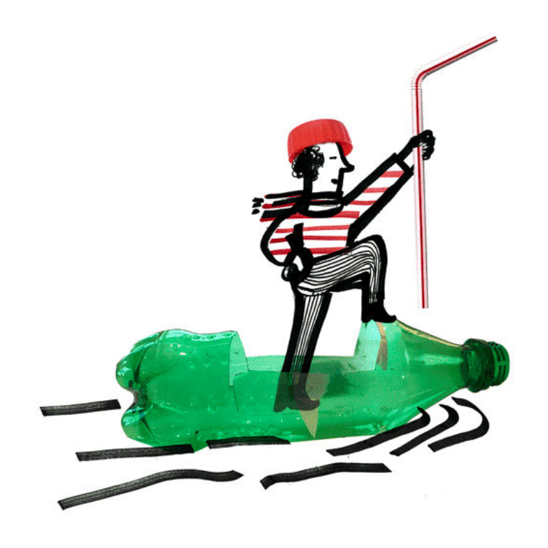
SINCE 1960, OUR POPULATION INCREASED 80%. BUT OUR TRASH GREW 200%.