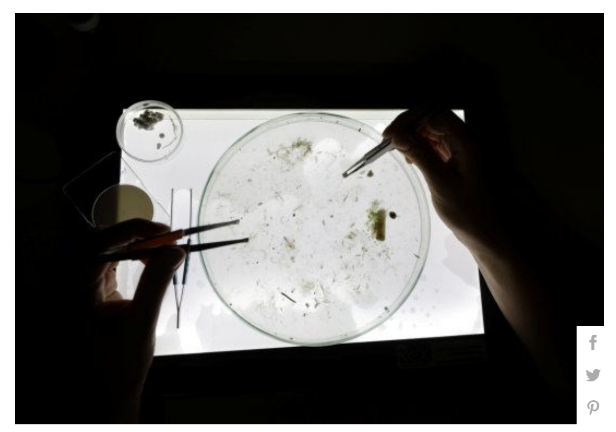
Scientists said the health effects of swallowing plastic is not yet known

The study took data from 26 previous studies that measured the amounts of microplastic particles in fish, shellfish, sugar, salt, beer and water, as well as in the air in cities.