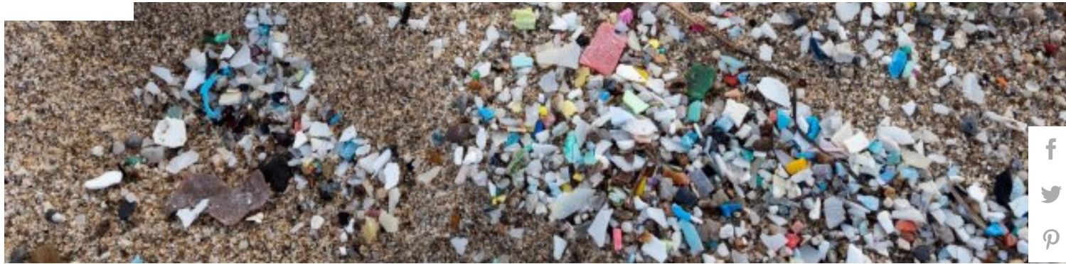
Microplastics end up in the soil, rivers, oceans and air because of plastic pollution