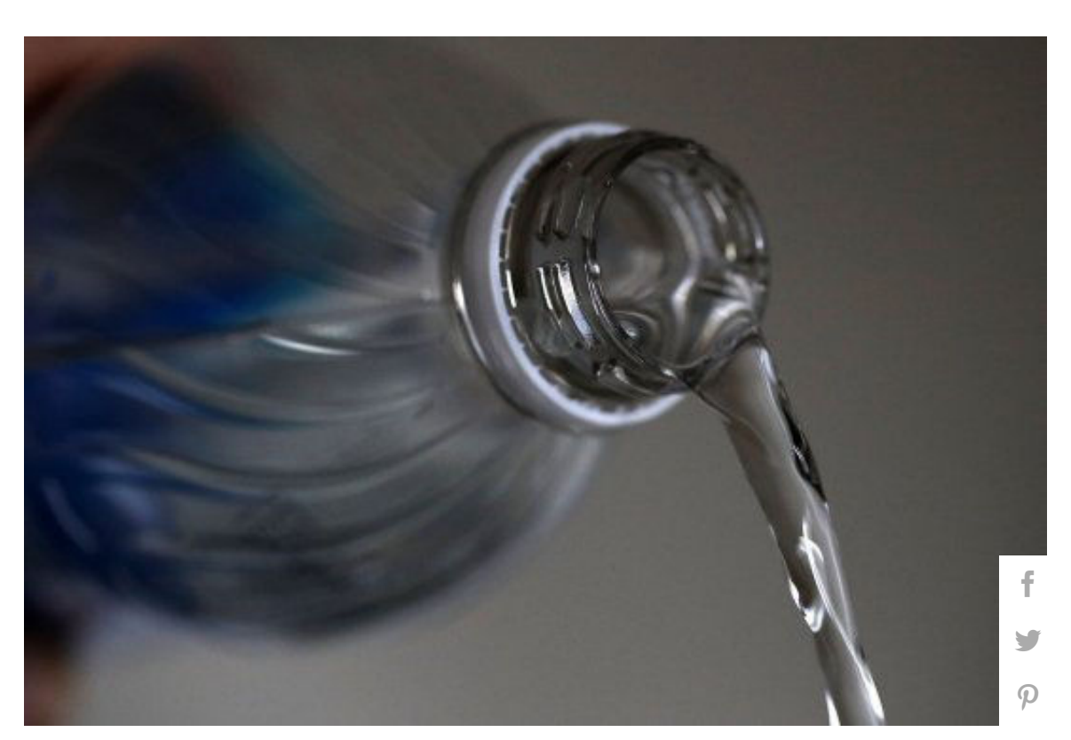
Data on bottled water showed it contains 22 times more microplastic than tap water

'It is really highly likely there is going to be large amounts of plastic particles in these. You could be heading into the hundreds of thousands.'